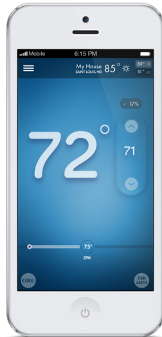
Sensi App - Call for Cooling

Keypad lockout with full control from app