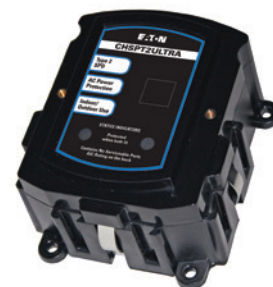
Complete Home Surge Protector (Externally mounted to your breaker box)