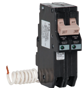
Complete Home Surge Circuit Breaker (Internally mounted to your breaker box)